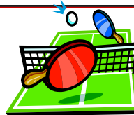
TABLE Tennis: June 1–4 From 9 am–12 noon Location: Academy Park

VOLLEYBALL: June 8–11 From 9 am–12 noon Location: Academy Park